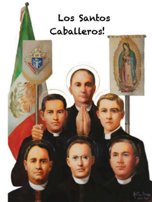
Los Santos Caballeros!