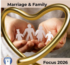
Marriage & Family